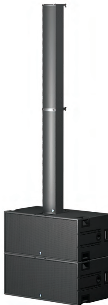
Dual IC215S-R subwoofers shown with stacked IC Live Arrays